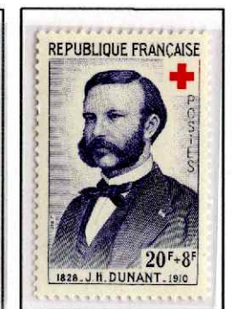
J.H.Dunant (Founder of Red Cross)