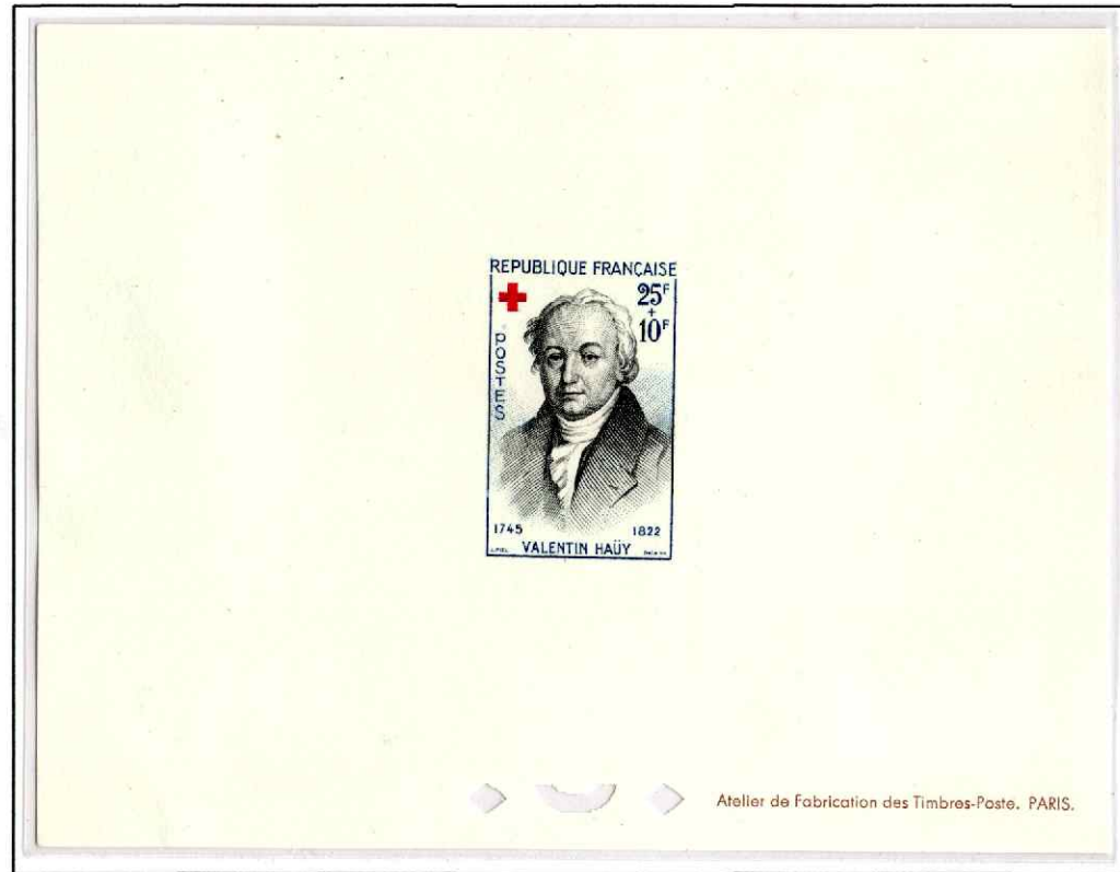
Valentin Haüy ~ Teacher of the Blind Valentin Haüy (13 Nov 1745 – 19 Mar 1822) was the founder, in 1785, of the first school for the blind, the Institute for Blind Youth in Paris, or the National Institute for the Young Blind , INJA). In 1819, Louis Braille entered this school