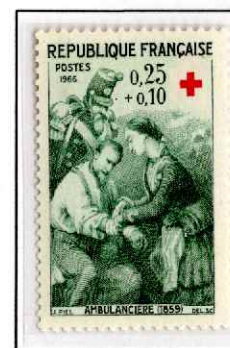
Nurse Tending Wounded Soldier (1859)