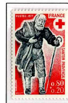
"Old Man" (Figures from Provence)