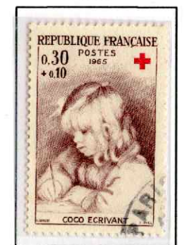
"Coco Ecrivain" (Portrait of Renoir's son)