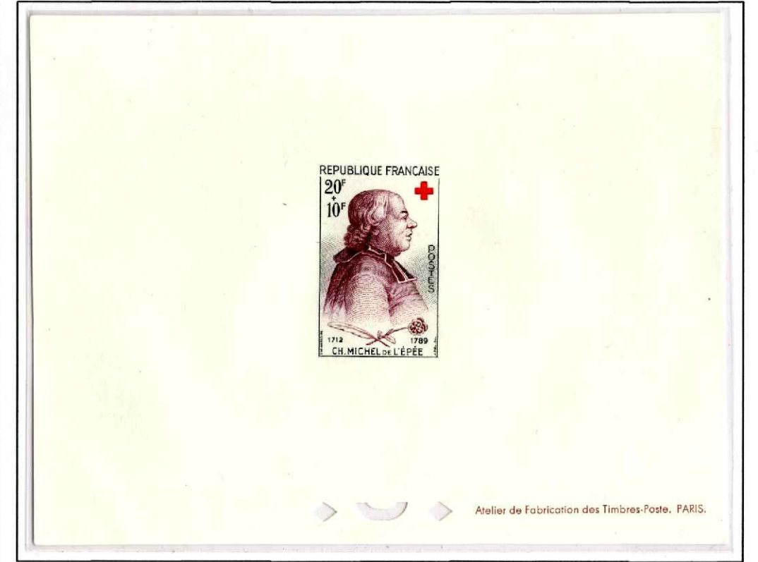
Abbe C.M. de L'Epee ~ Teacher of Deaf Mutes Abbe de L'Epee (24 Nov 1712 – 23 Dec 1789) was an 18 th century French clergyman and educator. He is known for his significant contributions to the education and communication of deaf individuals. L'Epee developed a method of sign language and established the first free school for the deaf in Paris, revolutionizing deaf education globally.

Reunion 1963. Surch.12+5 French African CFA franc