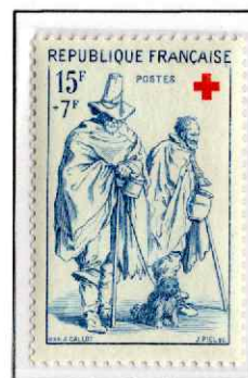
Blind and Beggar (Jacques Callot 1592-1635)