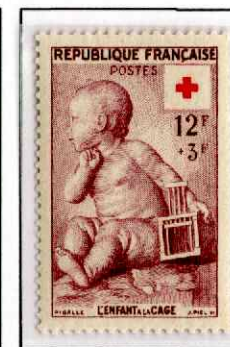
Child and Cage (after Pigalle)