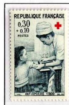
Nurse Tending Young Girl (1966)