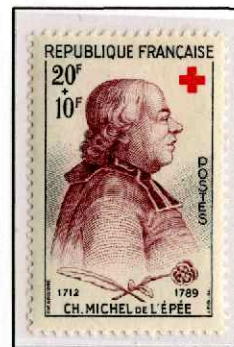
Abbe C.M.de L'Epee