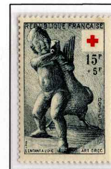
Child with a Goose (Greek Statue)