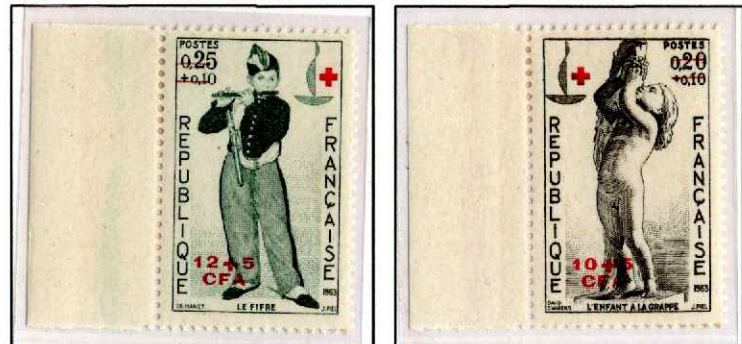
"The Piper" (Manet)

Reunion 1963. Surch.12+5 French African CFA franc