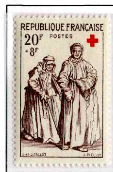
One-eyed and Beggar